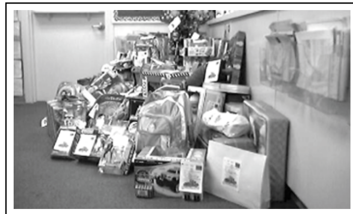
Here is a sample of the 176 gifts students and staff collected for the Giving Tree

Charity may start at home, but we believe it continues at school.